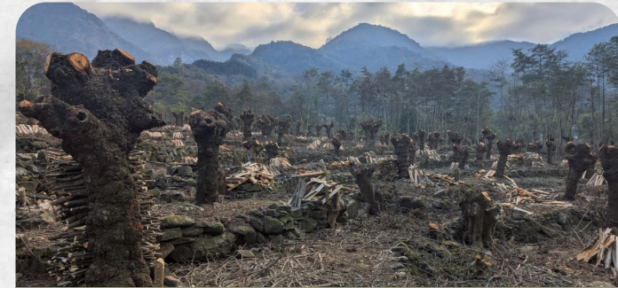
Agroforestry in Khonoma

The concept of the Project is to adopt and conserve individual, clan, and community forests, support green growth and sustainable livelihood enhancement, and have provision for ecosystem services.